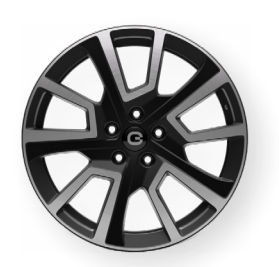
Alloy wheels Diamond Black, machine-surfaced with 225/40 R18 all season tyres